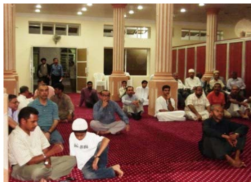
Community members listening to the lectures in Imambargha.