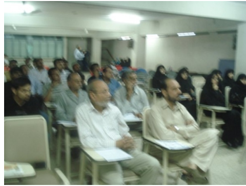
Participants of Training