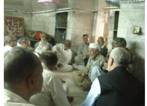
Nauha recitation inside the cave