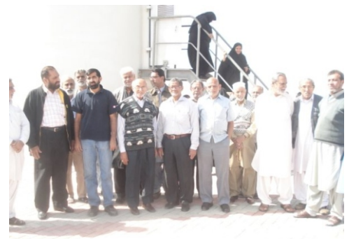
Seniors at Wind Power project

The seniors also enjoying the Scenic beauty of the lake overlooking from the hillock. After staying here for some on reciting a Nauha inside the cave the seniors returned to Jhampir on their way back to Karachi where they reached at 9:30 p.m. and joined the crowd of Majlis and had Niyaz for dinner. It was pleasant and safe journey for the seniors.